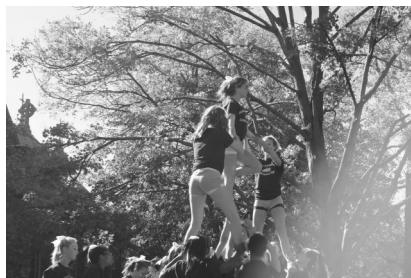
Cheerleaders show off their routines

To kick off the school year, GCA celebrated its annual Spirit Week! Our freshmen, sophomores, juniors and seniors pitched in to fund money for our annual walkathon. The money this year will be for a new workout room. In return for participation in the fundraiser, the students were given a week to happily dress down and show some cougar spirit.