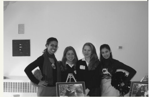
Students accompanied by a teacher greeted people